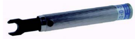
torque wrench (standard style)